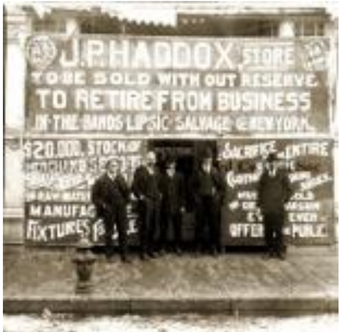
Fig. 9: Haddox store photo

The economic drain of the brewery appears to have brought down Haddox's Winchester clothing business, located at 148 Main Street (now Loudoun Street). A 1908 photograph ( Fig. 9 ) tells the story: "J. P. Haddox store to be sold without reserve...to retire from business." Haddox's entire stock, pegged at worth $20,000, was to be disposed of and the store had been put into the hands of a New York salvage firm.