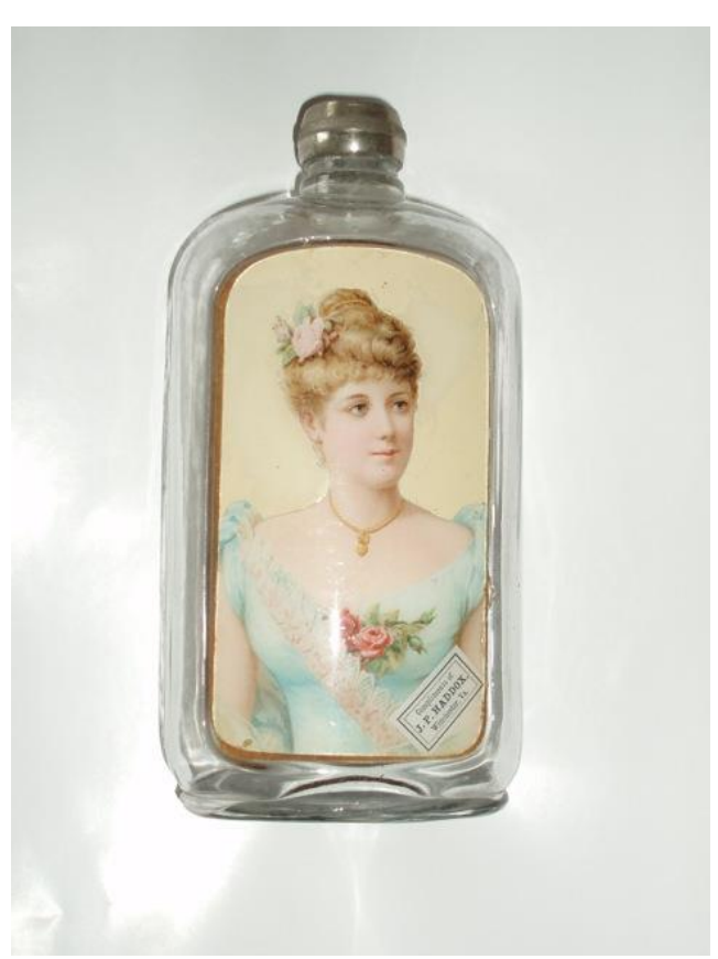
Fig. 2: Woman picture flask

Symbols of his prosperity in the liquor trade were the quality of his give-away items to special customers. Haddox's label under glass flasks, including one with a fancy lady ( Fig. 2 ), were relatively pricey items, as was a silver plated match safe ( Fig. 3 ). The safe, dated 1898, bears the inscription, "Compliments of J. P. Haddox, leader in fine wines, liquors and bottler of the Belvidere Brewing Co.'s high grade lager beer."