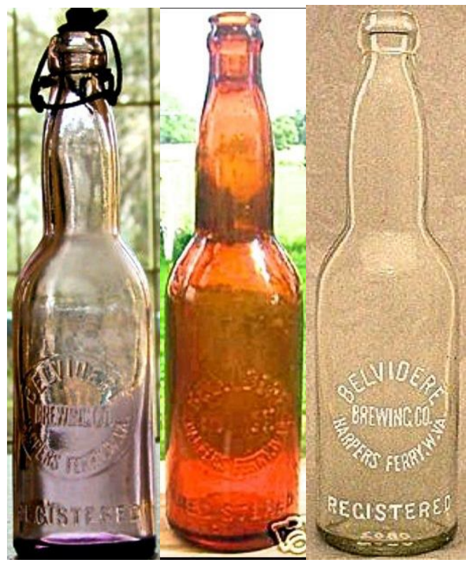
Fig. 4- Fig. 6: Belvidere bottles

Obviously sensing an opportunity, in 1898 Haddox and two Winchester brothers named Savage purchased the brewery property for a bargain basement $4,000 and began to make a beer they called "Belvidere," a name they registered with the Federal Patent and Trademark office. As shown here they packaged their brew in both clear and amber bottles, some with porcelain closures ( Figs. 4-6 ). In addition to paper labels their bottles were embossed with the name of the company.