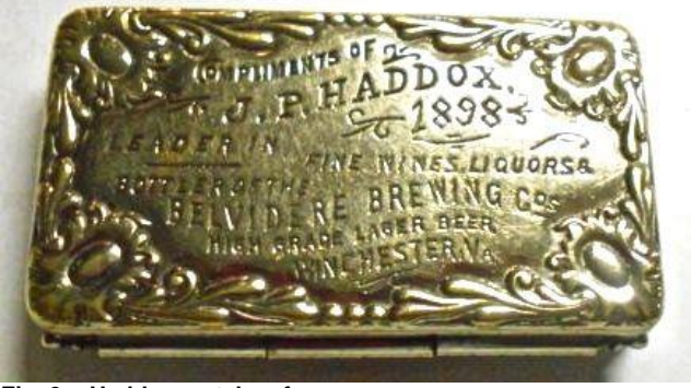
Fig. 3: Haddox match safe