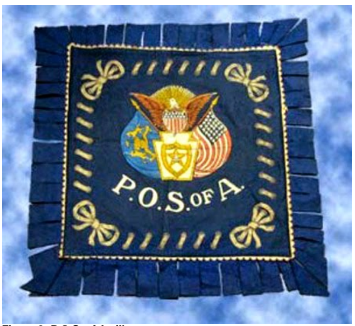
Figure 9: P.O.S. of A pillow

Note: The P.O.S. of A., memorialized here on a pillow cover ( Fig. 9 ), once had several hundred camps (lodges) with several thousand members in the U.S. and its territories but chapters now are found only in Pennsylvania, North Carolina, New Jersey and Louisiana. The motto of the organization is "God, Our Country and Our Order."