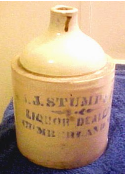
Figure 2: Cobalt stenciled jug

As a wholesaler, Stump provided his liquor in large ceramic jugs to his customers. He appears to have used a variety of containers. They included a crude stoneware with a cobalt stenciled lettering ( Figs. 2,3 ) and a more finished jug with a Albany slip top and handle and a Bristol glaze base and under glaze lettering ( Fig. 4 ). Like other liquor dealers trying to keep ahead of the competition, Stump also featured a number of giveaway items to favored customers. Among them were small jugs holding a few swallows of whiskey ( Figs. 5, 6 ) Bearing the label "Compliments of John J. Stump & Co.," they clearly were meant to be gifted.