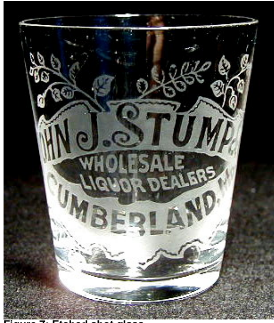
Figure 7: Etched shot glass

For his wholesale clients, largely saloons, he provided the bartenders with fancy etched shot glasses ( Fig. 7, 8 ). The similar two shown here appear to be the work of George Troug, acknowledged as the outstanding shot glass etcher in American history. Troug was the proprietor of the Maryland Glass Etching Works in Cumberland from 1893 until 1911. Stump's glasses bear the unmistakable artistry of this Italian immigrant who arrived in the U.S. in 1883.