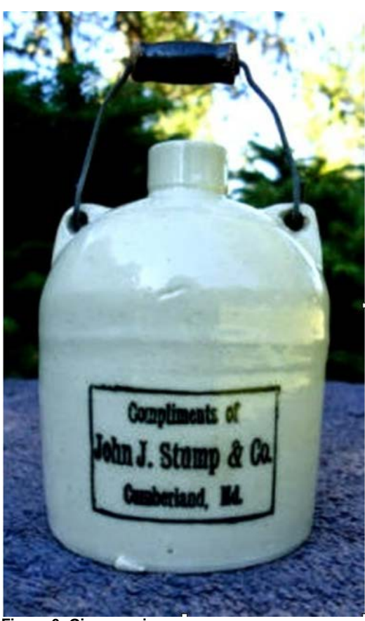
Figure 6: Giveaway jug

For his wholesale clients, largely saloons, he provided the bartenders with fancy etched shot glasses ( Fig. 7, 8 ). The similar two shown here appear to be the work of George Troug, acknowledged as the outstanding shot glass etcher in American history. Troug was the proprietor of the Maryland Glass Etching Works in Cumberland from 1893 until 1911. Stump's glasses bear the unmistakable artistry of this Italian immigrant who arrived in the U.S. in 1883.