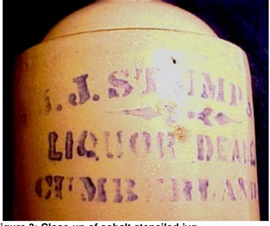
Figure 3: Close-up of cobalt stenciled jug