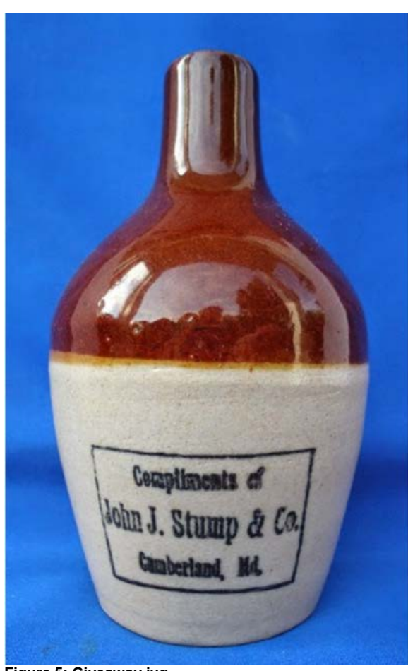
Figure 5: Giveaway jug