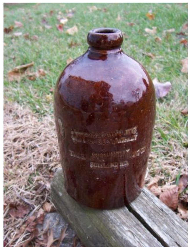
Fig. 5. Suit jug #2