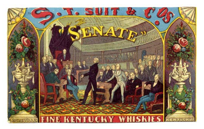
Fig. 3: Trade Card #2 - Senate

The Maryland distiller did not come empty handed to the Congress and Suit's brown jugs in their numerous formats were said to be a frequent sight in the hallowed halls ( Figs. 4 & 5 ). For those special friends in high places, he presented a decanter that noted the date of his establishing his distillery ( Fig. 6 ). He also made sure his whiskey was sold in the finest Washington D.C. hotels, like the Grand Central ( Fig. 7 ).