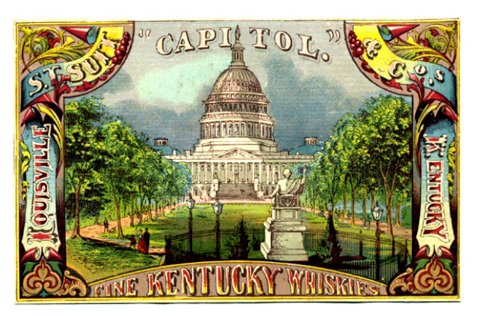
Fig. 2. Trade Card #1- Capitol

Throughout his career Suit was a man with a keen eye for political clout and ingratiating himself with the power brokers of his time. Colorful trade cards for his whiskey reeked of Washington, D.C. One shown here speaks of "fine Kentucky whiskey," but shows the U.S. Capitol, including the back of a toga clad George Washington statue that once stood there ( Fig. 2 ). Suit matched that with an equally colorful trade card of the U.S. Senate looking much as it did at his time ( Fig. 3 ). It may be imagined that Suit himself frequently was in the gallery or off the floor in the lobbies.