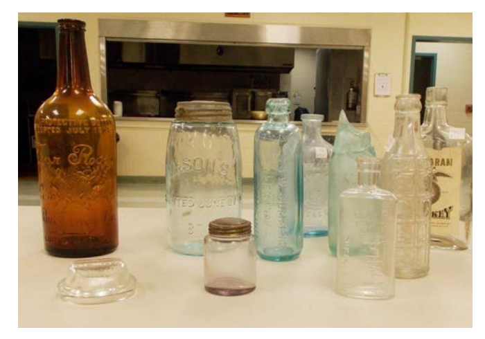
Show & tell items at our June meeting featured summer dates.

Directions: Fort Hunt Park is located 5 miles south of Old Town Alexandria along the George Washington Memorial Parkway (parts of which are also called Mount Vernon Highway and Washington Street) in Fairfax County, Virginia. To reach this road from Washington, DC, cross the 14<sup>th</sup> Street Bridge south toward Virginia, and take the exit for Mount Vernon/National Airport. To reach it from the Beltway in Maryland, take the very first exit after the Wilson Bridge. To reach it from the Beltway in Virginia take exit 1 North, go to the first traffic light and take a right on Franklin Street; go about 3 blocks and take a right on South Washington Street.