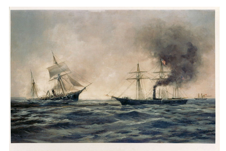
Fig. 8: Sinking of the Alabama

Powerful forces in Washington howled for retribution in what became known as "The Alabama Claims." Senator Charles Sumner, chairman of the Senate Foreign Relations Committee, wanted $2 billion in damages ($50 billion in today's dollar), or alternatively, the ceding of Canada to the United States. Secretary of State Seward sought to take British Columbia. Other important figures coveted Nova Scotia as compensation. As the British stalled, fervor over annexing parts of Canada gradually ebbed in the U.S. and in 1870 President Grant sought to end the dispute through international arbitration.