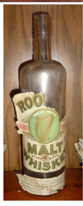
Fig. 3: Rooney Malt bottle