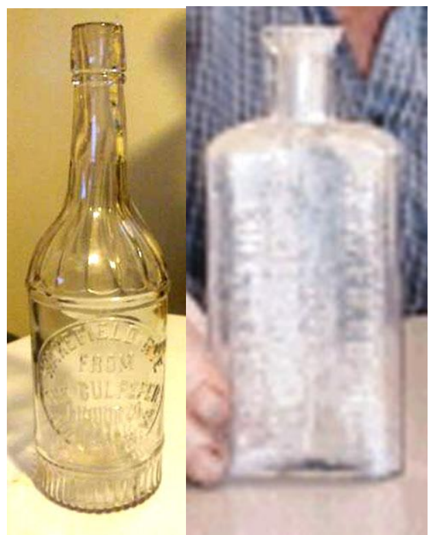
Fig. 10: Wakefield Rye bottle Fig. 11: Wakefield Rye mini-flask

who found it is a native of Culpeper who has been trying to learn more about the company origins for the past 22 years, with no success. My efforts, considerably less time consuming, have been similarly fruitless. This one remains a mystery.