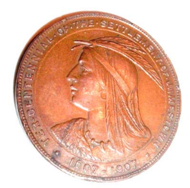
Fig. 11: Expo medallion front