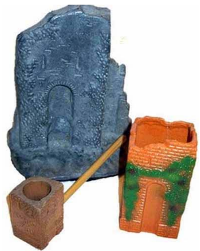
Fig. 8: Ceramic souvenirs