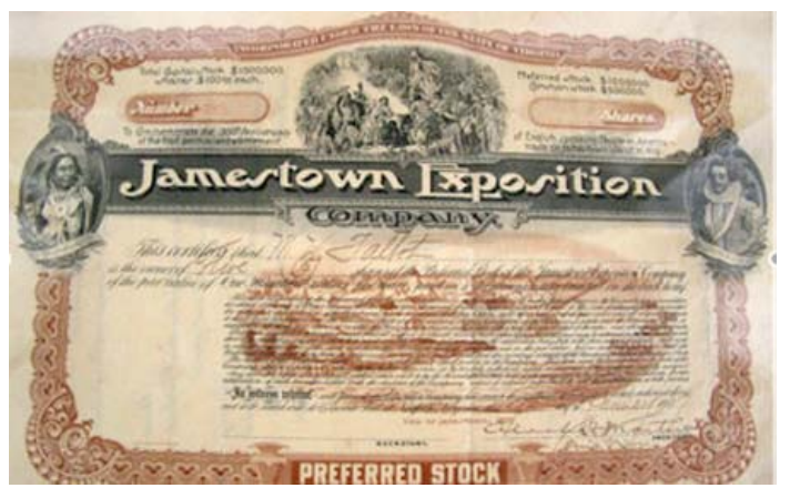
Fig: 4: Expo stock certificate