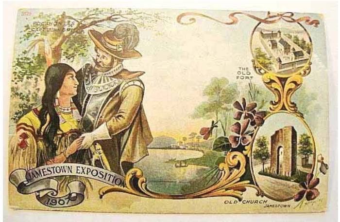
Fig. 1: Smith/Pocohontas postcard

Commonwealth boosters, recognizing the financial boon the earlier fairs had been, had dollars signs dancing before their eyes. Who could resist reliving the story of Pocohontas and Captain John Smith, a staple of every American's primary school history book? ( Fig. 1 ). The actual isolated and abandoned original site of the Jamestown Settlement was not considered by anyone to be suitable. Supporters were divided between Richmond and the Hampton Roads area. Eventually the latter was chosen.