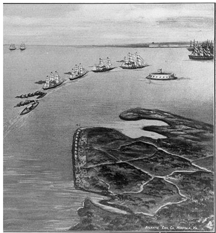
Fig. 2: Illustration of Sewell's Point

The decision was to locate the international exposition on a mile-long piece of ground at Sewell's Point, once the site of a Civil War battle ( Fig. 2 ). A key reason for choosing that spot was that it was a "politically correct" equal distance from Norfolk, Portsmouth, Newport News and Hampton. A postcard presented an artist's rendition of what the fair was to look like ( Fig. 3 ). The organizers successfully lobbied the Federal Government for a loan of $1,640,000 that was to be repaid by a lien of 40% of the gate receipts. The organizers also sold stock to the public ( Fig. 4 ).