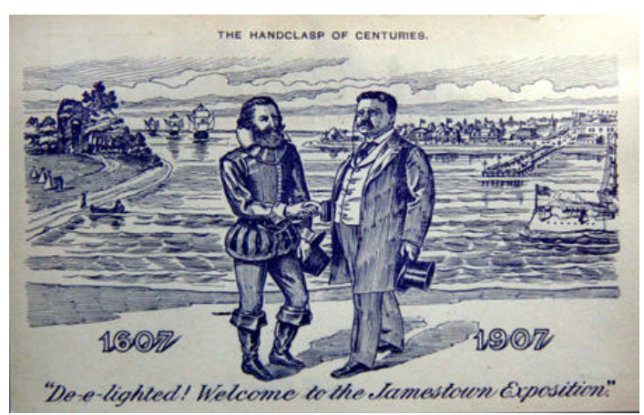
Fig. 5: President Theodore Roosevelt at the Expo

With President Theodore Roosevelt in attendance and drawing a large and enthusiastic crowd on opening day, those problems initially were forgotten ( Fig. 5 ). But not for long. Attendance quickly slumped to only 13,000 a day, of whom only an average of 7,400 actually paid to get in. The Fair began to receive negative publicity in the press. Reporters noted the unfinished state of the grounds, the high prices being gouged by area hotels, and the poor transportation arrangements.