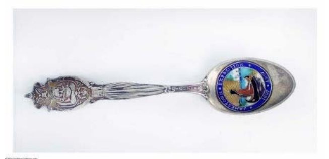
Fig. 10: Souvenir spoon

13) and the Baltimore City building (Fig. 14). To all of them you could affix a special one cent stamp showing Capt. John Smith (Fig. 15), part of a three set of U.S. commemoratives of the Tricentennial.