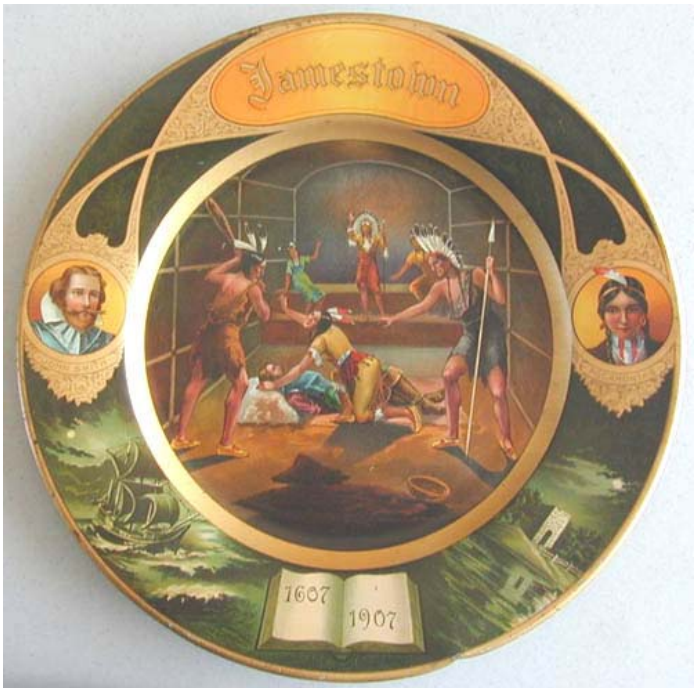
Fig 9: Souvenir plate

A souvenir spoon was a hot item with John Smith stamped into the handle and an Indian in a canoe pictured on the bowl (Fig. 10). A special medallion celebrated an Indian on the front and ships on the back (Fig. 11,12). For alerting the home folks about your attendance at the Exposition you could choose an array of postcards, including the Virginia State Building (Fig.