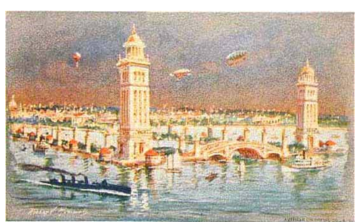
Fig. 3: Artist's concept of Expo grounds