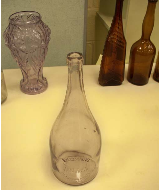
Danhakl bottle and other items displayed at our November meeting.