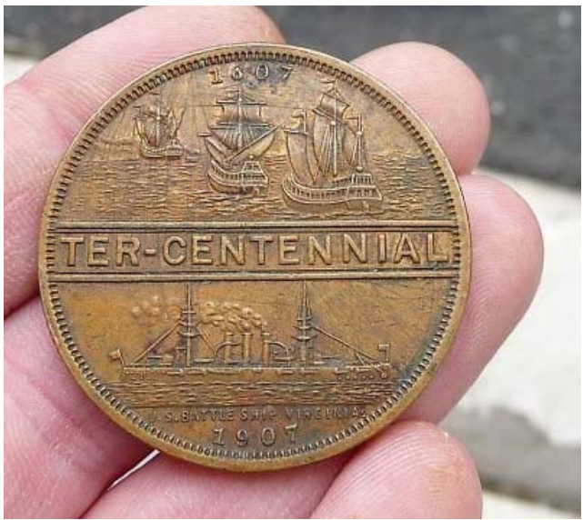
Fig. 12: Expo medallion back