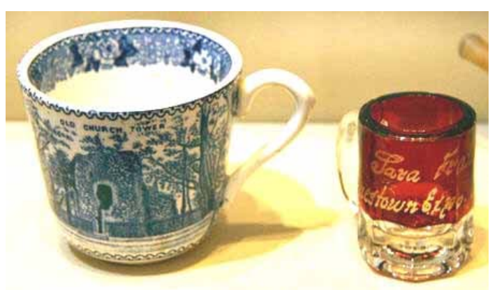
Fig. 6: Souvenir cups

Also available were a large number of commemorative items to be bought and taken home as souvenirs for those who struggled through the gates. Among them were souvenir cups of ceramic and glass of sizes to accommodate beverages from beer to tea ( Fig. 6,7 ). Visitors could purchase a plate that depicted Pocohontas saving the life of John Smith ( Fig. 8 ) or replicas of the ruined Jamestown "Old Church" useful as a bookend or vase or even as a clay pipe ( Fig. 9 ).