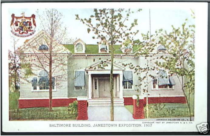
Fig. 14: Baltimore City Building postcard