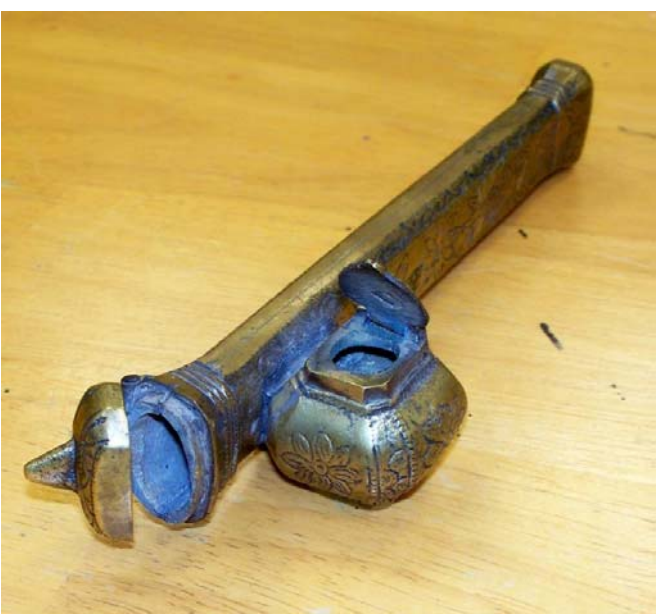
Lee Shipman displayed this surveyor's pen and ink holder at our November meeting. The pens carried in this type of container were quills used by 18th Century travelers.