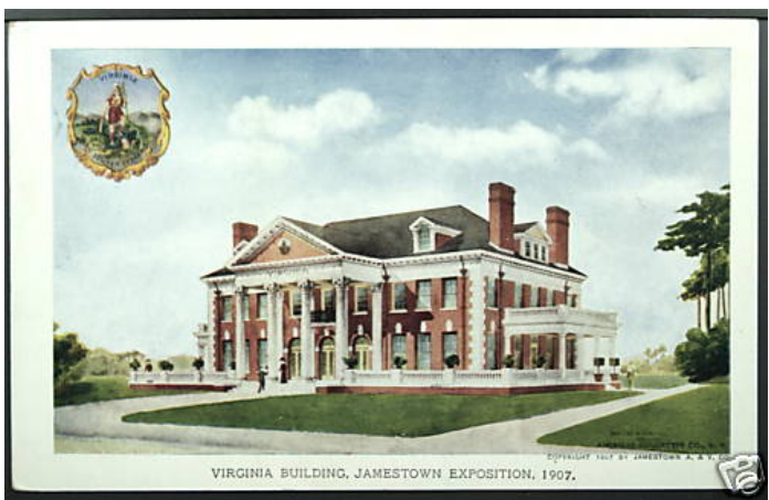
Fig. 13: Virginia State Building postcard