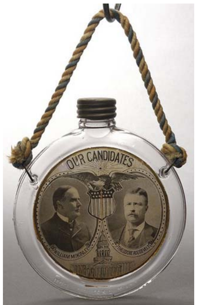
Fig. 2: McKinley-Roosevelt Canteen

For example, in the election of 1900 when William McKinley was running for President and Teddy for Vice President, the Republican Party issued a glass canteen with the pictures of the two and the U.S. Capitol ( Fig. 2 ). I have rejected this bottle because by 1904 McKinley had been assassinated, and even Carrie – who also hated McKinley – would not have been that vindictive.