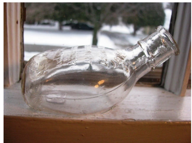
Fig: 9 Teddy's Pet" bottle., view 2

A more logical explanation is that the bottle was given away by his opponents during his Presidential campaign in 1904. References to alimony and matrimony are embossed on the bottle. They appear directed at Roosevelt's brother, Elliott, who had just gone through a messy and well reported divorce. With this interpretation Teddy's "Pet" was his black sheep sibling.