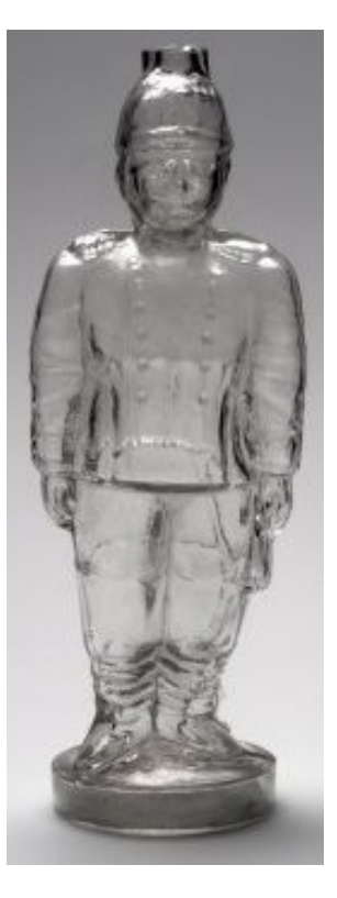
Fig. 3: Rough Rider figural

A figural bottle of Roosevelt as a Rough Rider exists from that era ( Fig. 3 ). It is not, however, immediately recognizable as the man who galloped down San Juan Hill in Cuba and extended the ride right into the White House. Shown here is the photo that Teddy chose for the dust jacket of his book on the Rough Riders ( Fig. 4 ). Note that the head covering is very different and that the tunic on the bottle has two rows of buttons; Roosevelt's uniform has only one.