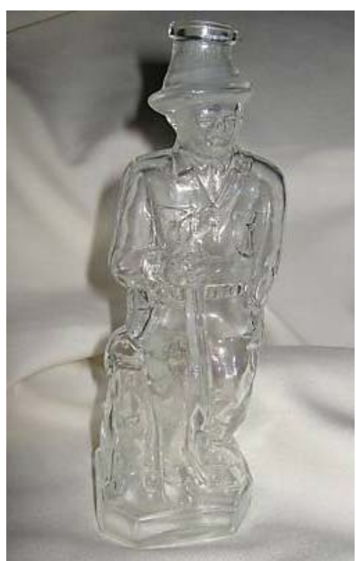
Fig. 5: Great Hunter figural

Another figural that purports to be that of TR depicts him as a big game hunter ( Fig. 5 ). This one is more true to life. Comparing it with a photo of Roosevelt after shooting an elephant, it recreates his brimmed hat and his rifle ( Fig. 6 ). His eyeglasses seem to have been lost in translation to glass.