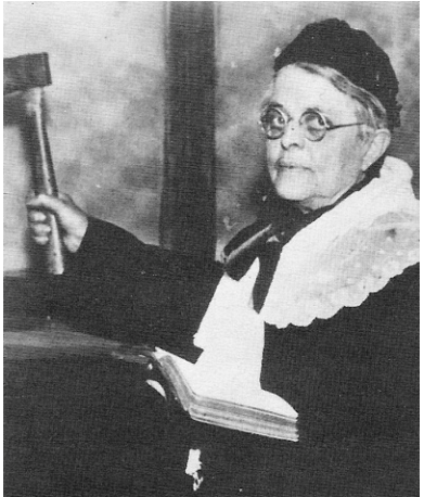
Fig. 1: Carry Nation with ax and Bible

In a 2009 article for the Pontil I recounted the story of Carrie Nation, the famed ax-wielding proponent of Prohibition ( Fig. 1 ) and her 1904 invasion of Washington, D.C. The article described her attempt to see President Theodore Roosevelt and after being turned away at the White House, invading the U.S. Senate, raising a ruckus, getting arrested and being fined $25.