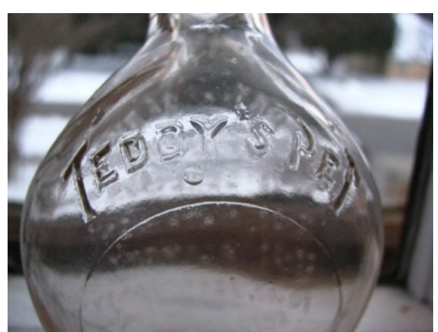
Fig. 8: "Teddy's Pet" bottle, view 1

A container shaped like a nursing bottle, one that probably held whiskey, is embossed "Teddy's Pet." It is shown here in several views ( Fig. 8,9 ). There are conflicting views on its intent. One opinion is that it refers to the Panama Canal which TR vigorously was pushing through to completion