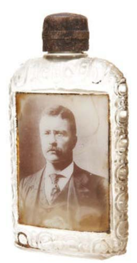
Fig. 11: TR Campaign flask 2

A final note: Carrie herself eventually became the subject of a bottle ( Fig. 12 ). It shows the ax-wielder with her trademark large handbag and an umbrella. The clear glass figural carries an Owens-Illinois mark that indicates manufacture sometime post-1929, years after Ms. Nation's death in 1911. The bottle originally contained – what else? – vinegar. Teddy Roosevelt would have loved the joke.