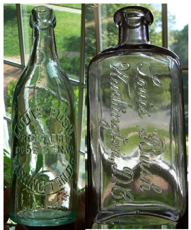
Fig 2: Louis Bush Beer Bottle (left) Fig. 3: Louis Bush Bottle (right)

Louis was a bottler at 803 D Street NW in 1892, then a restaurant owner at 1305 E Street from 1893-1914. Washington Post ads described Louis's restaurant as an "elegantly appointed ladies café", which displayed art, and sold wine & liquors. Various brands of beer and liquor were advertised, some of them sold exclusively at Louis's café. Figure 2 shows a LOUIS BUSH beer bottle from the 1305 E Street address (the restaurant). Figure 3 shows a LOUIS BUSH embossed liquor bottle.