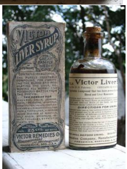
Fig. 5: Victor Liver Syrup labeled and box