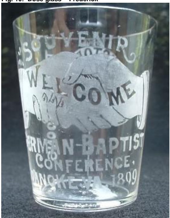
Fig. 11: Dose glass - Roanoke