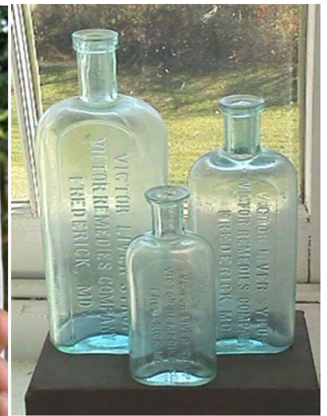
Fig. 6: Three sizes Victor Liver Syrup