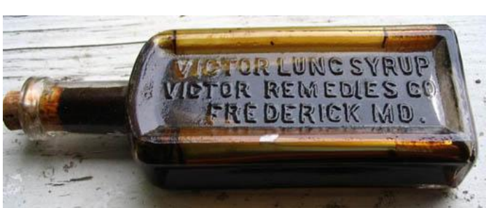
Fig. 4: Victor Lung Syrup bottle

Infants Relief which he claimed cured "all bowel diseases." ( Fig. 7 ) It contained cannabis and chloroform. Fahrney recommended it for babies as young as two days.