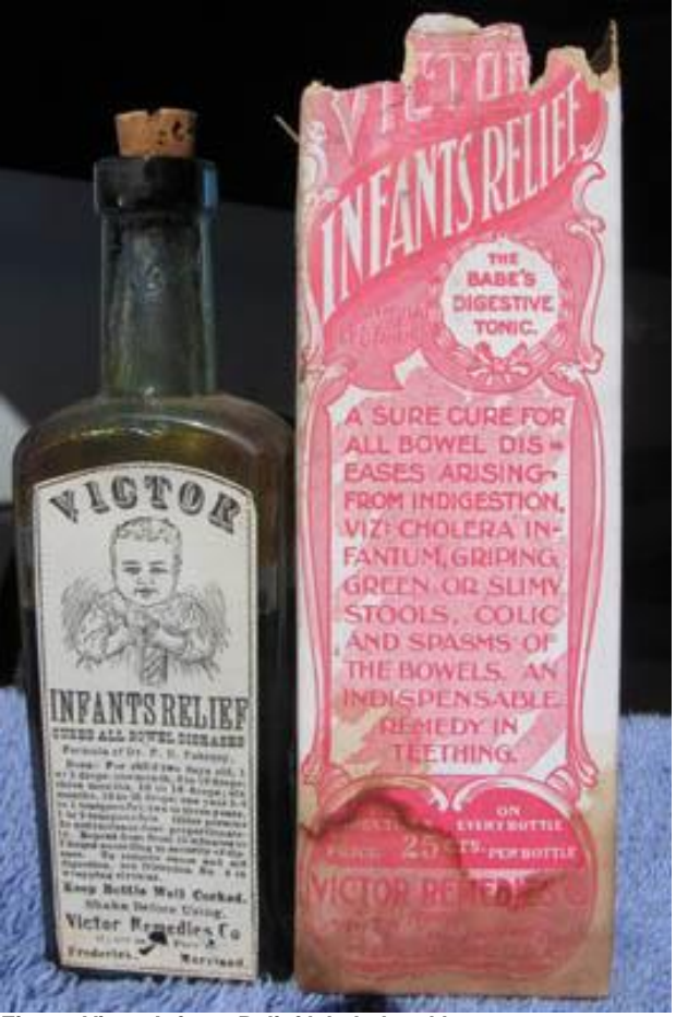
Fig. 7: Victor Infants Relief labeled and box