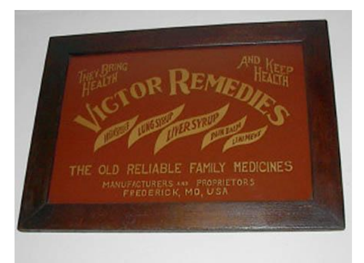
Fig. 8: Victor drug store sign

Like other quack medicine peddlers, P.D. advertised his products widely by signs in drug stores ( Fig. 8 ) and giveaway items like almanacs ( Fig. 9 ). The latter contained basic information on weather, weights and measures and lots of hyperbole about Victor remedies.