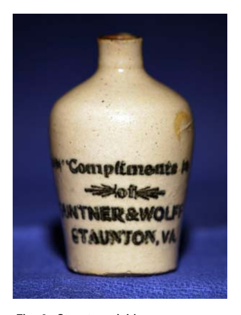
Fig. 9: Staunton mini-jug

The last example comes from Staunton (pronounced Stanton), Virginia, with compliments of Gunter & Wolff (Fig. 9). Except for being able to identify the jug as pre-Prohibition, little else has emerged from my research efforts. I assume that some time spent in the local history section of the Staunton library would shed more light on the partnership that produced it.