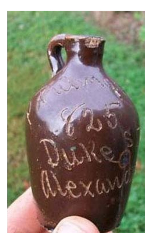
Fig. 1: Pulham Alexandria mini-jug