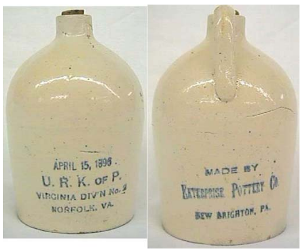
Fig. 4: URKP Norfolk mini-jug

While it is possible to date most mini-jugs as pre-Prohibition artifacts, as the first two shown here, it often is difficult to pinpoint the exact year of issuance. Not so with a mini-jug from Norfolk (Fig. 4). It is clearly dated at 1896. The initials stand for the Uniform Ranks, Knights of Pythias. This is a fraternal group and secret society founded in 1864 by Justus H.. Rathbone, a Washington D.C.-based Federal employee.