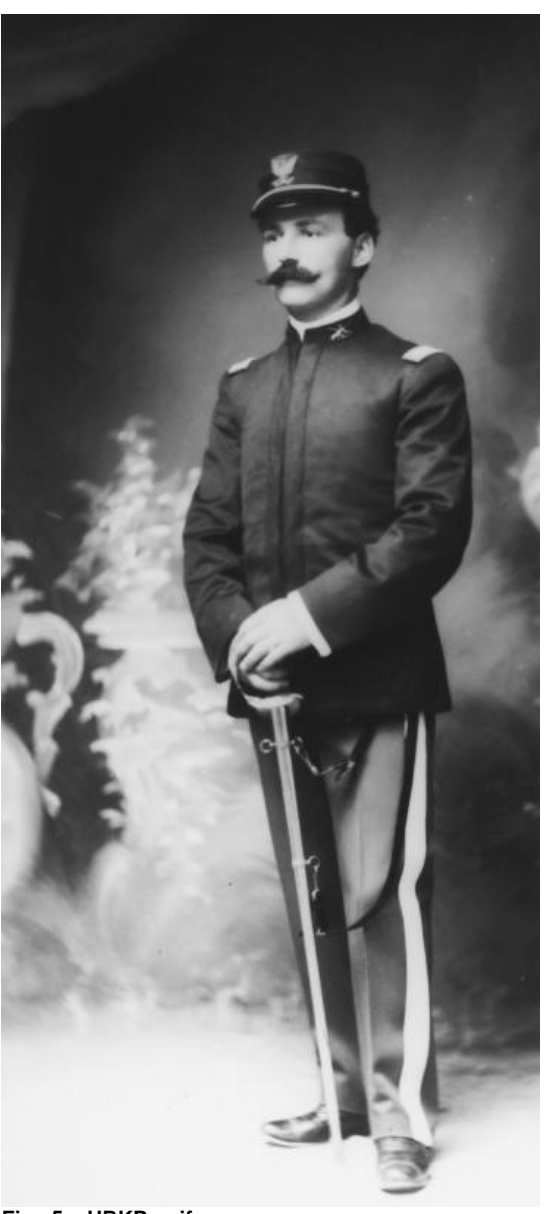
Fig. 5. URKP uniform

In the aftermath of the Civil War, Rathbone established the organization to further the ideals of male friendship and loyalty, basing it on the myth of Damon and Pythias. The fraternity grew very rapidly. The Uniform Ranks emerged out of drill corps units that had been organized within Pythian lodges. It was formally recognized as an associated group in 1878 and quickly grew to 100,000 men. Members wore special uniforms, shown here (Fig. 5). URKP declined as Civil War veterans died off and eventually was dissolved.