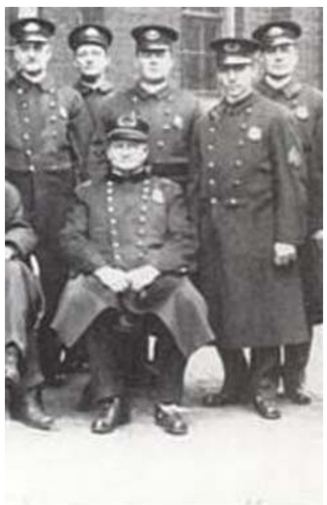
Fig. 3: Photo-Chief Goods with police

While it is possible to date most mini-jugs as pre-Prohibition artifacts, as the first two shown here, it often is difficult to pinpoint the exact year of issuance. Not so with a mini-jug from Norfolk (Fig. 4). It is clearly dated at 1896. The initials stand for the Uniform Ranks, Knights of Pythias. This is a fraternal group and secret society founded in 1864 by Justus H.. Rathbone, a Washington D.C.-based Federal employee.