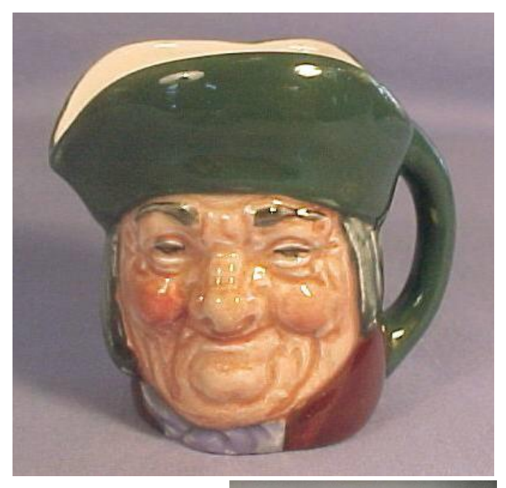
Fig. 2: Toby Filpott character jug (above)

As a result of this close identification of Fields with drinking, he has been depicted numerous times on spirits bottles, jugs, beer steins and mugs. In this mode, he is following in the line of a famous English souse generally known as "Toby Filpott." (Fig. 2). While Toby's origins are disputed, his face and body have been caricatured for more than four centuries in England as an icon of the tippler. Character jugs, such as those shown here, very often are referred to even today as "Toby Jugs." Fields in contemporary times has played the same role as Toby - the 20th Century image and icon of the drinking man. I have a whiskey decanter/jug from the Turtle Bay Distilling Company of Lawrenceburg, Kentucky, called W.C. Fields Kentucky Straight Bourbon Whiskey (Fig. 3). It dates from about 1970. In this case, Fields' head is filled with whiskey. It is accompanied by a water pitcher with a similar face (Fig. 4). Although neither item has a pottery mark, they are attributed to the McCoy Pottery Company of Roseville, Ohio.