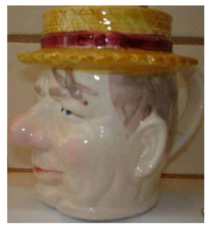
Fig. 9: Sigma the Tastesetter Fields water jug

Two other Toby-like jugs, perhaps designed as bar water pitchers, appear to have come from Japan. The first shows Fields in a straw boater hat with a more benign look than is usual ( Fig. 9 ). On the base a mark identifies this item as a creation of "Sigma the Tastesetter," This was a Japanese-based organization. A second jug ( Fig. 10 ) has no attribution but the appearance of the item also seems a product of Japan.