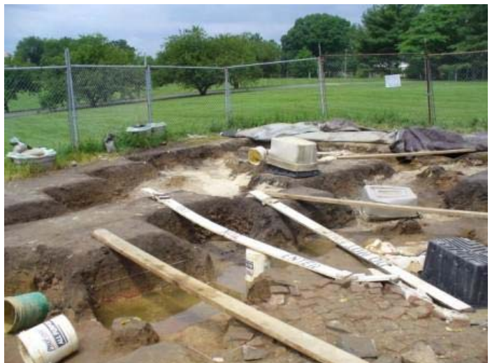
Figure 2: Foundation of 1781 laundry house

recently, so when they removed the tarp that covered it, things were pretty wet & muddy (figure 2). We could plainly see the 16-foot square stone foundation of the 1781 laundry house, as well as bits and pieces of the circa 1850 brick foundation. I could also see a shard of a bottle neck just lying on the ground, and I was dieing to pick up and examine it, but I had to resist the temptation.