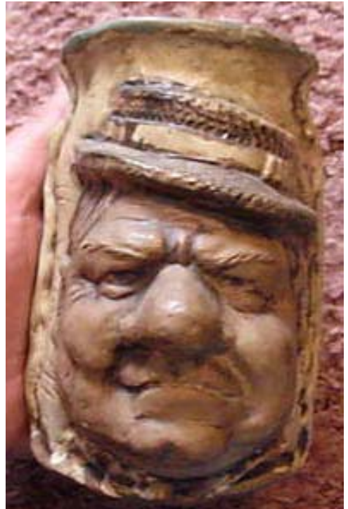
Fig. 11: Artisan-made beer mug

Fields also has been a popular figure for beer steins and mugs. One dated 1971 appears to be a hand-thrown artisan creation. The comedian, in bas relief, appears to be struggling to emerge from the vessel ( Fig. 11 ). A more conventional beer stein, unmarked, emphasizes Field's top hat and swollen nose ( Fig. 12 ). Finally, dated 1982, is a mug with a carnival glaze ( Fig. 13 ).