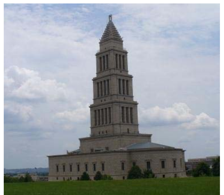
Figure 1: George Washington Masonic Temple

The orientation was at the George Washington Masonic temple (figure 1). That's because the dig site is on the grounds behind the temple. Half of the orientation was a crash course in archeology, and the other half was information about the dig site.