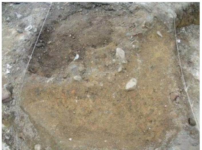
Figure 3: Mike's digging square in cellar of 1850's house

I showed up for the afternoon (1:00-4:00 PM) shift. We got a brief introduction to where all the tools were kept in the van, we each filled out a time sheet, then we were ready to start digging. The area was arranged into squares, and I was extremely happy that I got assigned to a square that was described as the cellar of the 1850's house where trash had been dumped. Figure 3 shows my assigned square which actually contained 2 "levels". The levels are defined by the color of the dirt. We learned at the orientation that changes in the color of the dirt can indicate different time periods. We also learned that