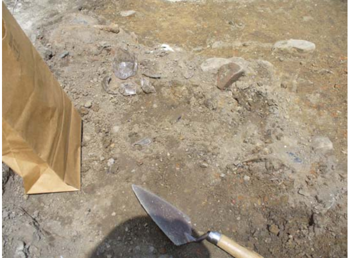
Mike's square midway through the dig

Figure 4 shows a close-up of what my square looked like half-way through the dig. I was working on finding pieces of what seemed to be an ornate drinking glass - you can see the pieces piled up near the top left of the photo. If you have a sharp eye, you can also see the corner-edge of a bottle near the center of the photo. That bottle was unfortunately broken into 2 pieces – I found the bottom of it in a spot about a foot away. It was embossed "LARKIN / SOAP CO / BUFFALO / NY" (see figure 5). I later did some research, and decided that the bottle was from 1890-1910, which is what the archeologist in charge said was the expected age of the artifacts I was digging.