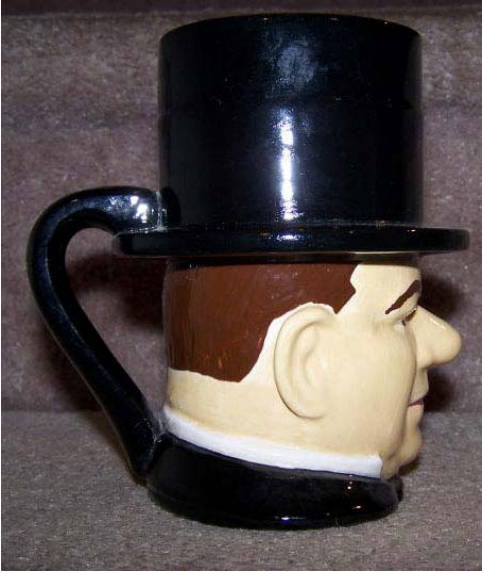
Fig. 10: Black Hat Fields water jug

Two other Toby-like jugs, perhaps designed as bar water pitchers, appear to have come from Japan. The first shows Fields in a straw boater hat with a more benign look than is usual ( Fig. 9 ). On the base a mark identifies this item as a creation of "Sigma the Tastesetter," This was a Japanese-based organization. A second jug ( Fig. 10 ) has no attribution but the appearance of the item also seems a product of Japan.