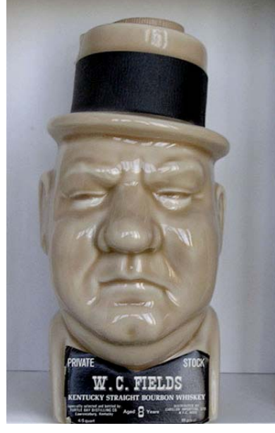
Fig. 3: Turtle Bay Distillery decanter jug (at left)

Fig. 2: Toby Filpott character jug (above)