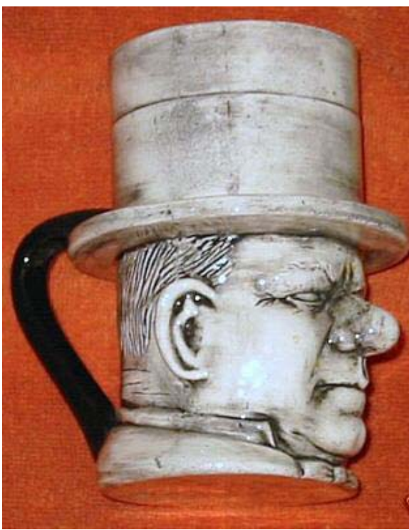
Fig. 12: Fields beer stein