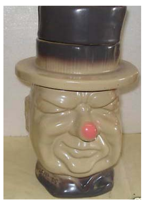
Fig. 14: McCoy Pottery cookie jar

Although the Fields image most often appears on items linked to drinking, the McCoy pottery also used his face as the motif for a ceramic cookie jar ( Fig. 14 ). He also makes appearances on a number of glass objects, including shot glasses, drinking glasses and decanters, such as a 1980 manufacture of the Wheaton Glass Company ( Fig. 15 ).