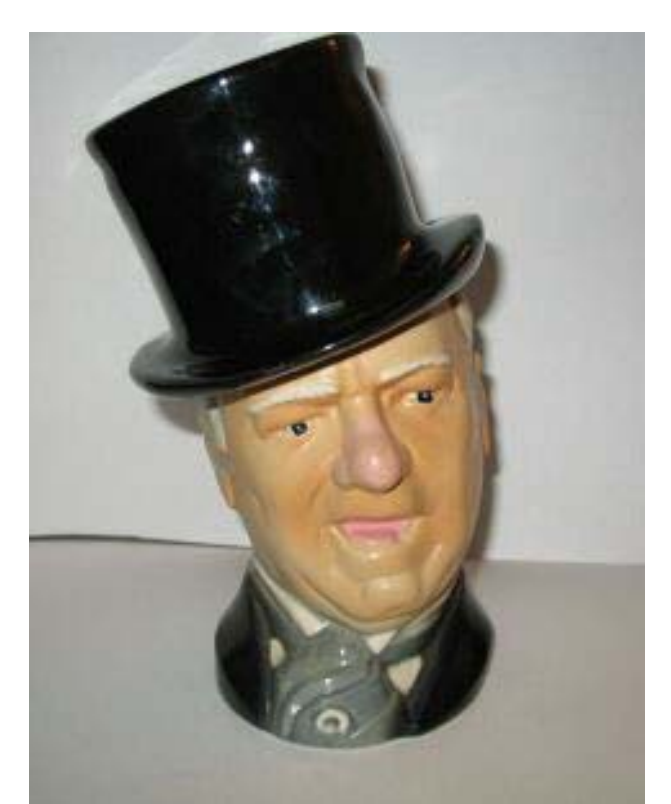
Fig. 6: Paul Lux Fields decanter jug - top hat