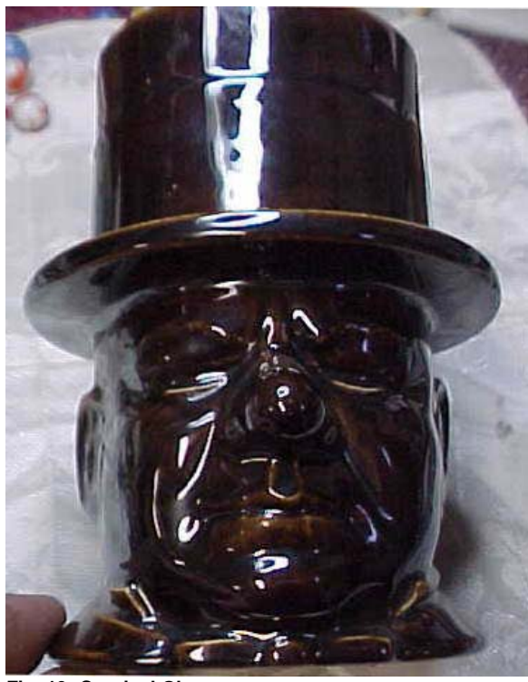
Fig. 13: Carnival Glaze mug

Although the Fields image most often appears on items linked to drinking, the McCoy pottery also used his face as the motif for a ceramic cookie jar ( Fig. 14 ). He also makes appearances on a number of glass objects, including shot glasses, drinking glasses and decanters, such as a 1980 manufacture of the Wheaton Glass Company ( Fig. 15 ).