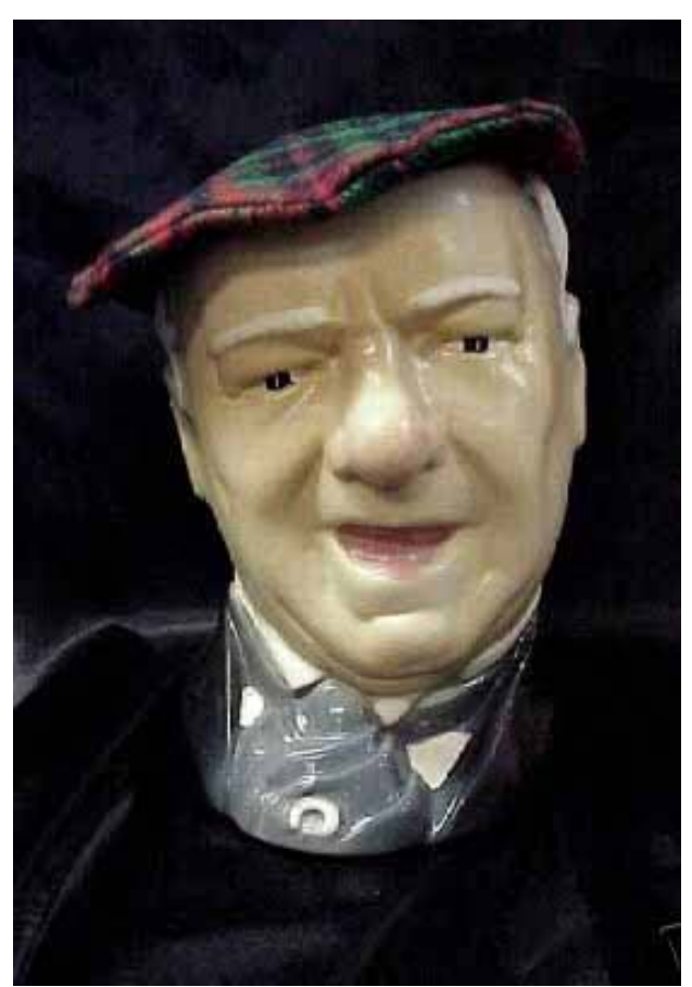
Fig. 7: Paul Lux Fields decanter jug - tam