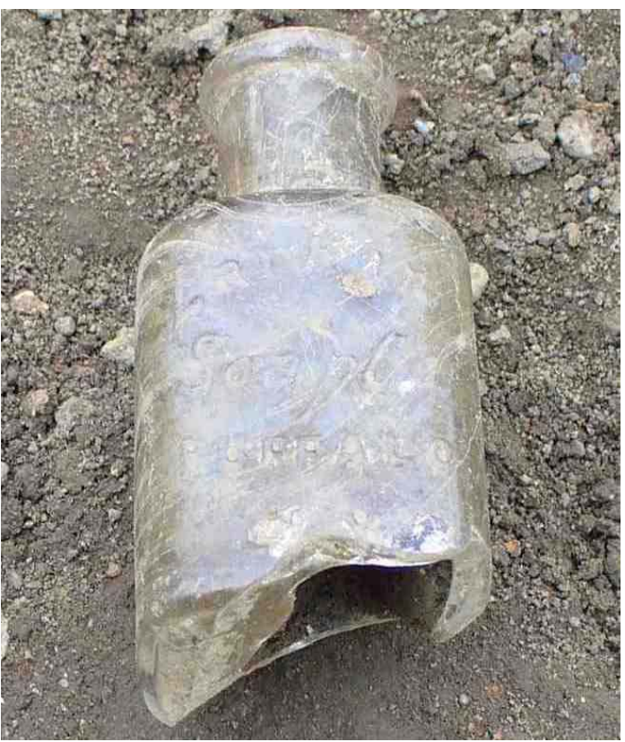
Figure 5: Larkin Soap Co bottle from Mike's square

I found one other bottle that was almost intact. It was embossed with "FILTRENE / SEWING MACHINE / OIL" on the front and "CHESEBROUGH" on the side. I also found lots of nails, ceramic shards and stoneware shards. I'm a little curious to see what they do with all the artifacts I put into my little paper bag – maybe at some point I'll volunteer to help out back at the lab and find out. The lab is located at the Torpedo factory in old-town Alexandria.