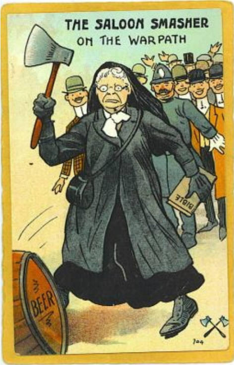
10. Postcard - Saloon Smasher #2

There can be little doubt, however, that the ceramic bottle in Fig. 3 is a whiskey nip, probably made in Germany. While it is not appear to be of Carry herself, it clearly is a spoof. The finely detailed figurine holds a purse from which protrude pamphlets with "Alkohol" on them ( Fig. 11 ). Not all Carry Nation artifacts poke fun. Among them are several varieties of hatchets issued by her adherents ( Figs. 12,13 ). The miniature hatchet with Carry's face on it came from the Ace Stove Company of Detroit, one of that city's largest stove manufacturers. The owner clearly was a Temperance advocate. Bearing a date of 1901, the item shown here may be a re-strike.