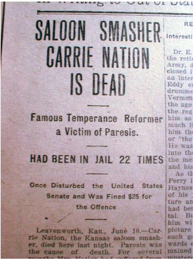
14. Newspaper story

Apparently satisfied with the havoc she had caused in Washington and without any hope of getting to see anyone in authority, Carry Nation went back home to Kansas. As her popularity and health declined, she and her husband went to Europe in 1909 and returned to live for a time in Washington. Still ignored by the power brokers, she moved back to Kansas and died there in February 1911 at 65 years of age. Her Washington exploits were prominent in stories of her demise ( Fig. 14 ). Ironically she died almost a decade before her fond dreams of a drinkless-America would come true in National Prohibition.