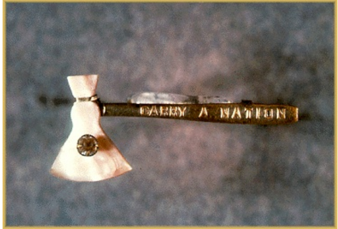
8. Hatchet pin