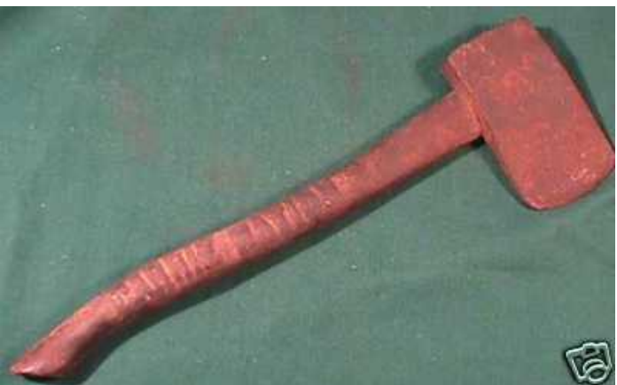
12. Miniature hatchet