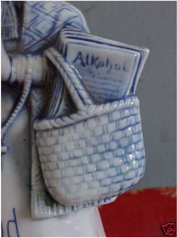
11. Detail of whiskey nip

There can be little doubt, however, that the ceramic bottle in Fig. 3 is a whiskey nip, probably made in Germany. While it is not appear to be of Carry herself, it clearly is a spoof. The finely detailed figurine holds a purse from which protrude pamphlets with "Alkohol" on them ( Fig. 11 ). Not all Carry Nation artifacts poke fun. Among them are several varieties of hatchets issued by her adherents ( Figs. 12,13 ). The miniature hatchet with Carry's face on it came from the Ace Stove Company of Detroit, one of that city's largest stove manufacturers. The owner clearly was a Temperance advocate. Bearing a date of 1901, the item shown here may be a re-strike.