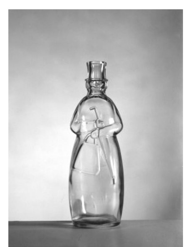
2. C. Nation figural bottle