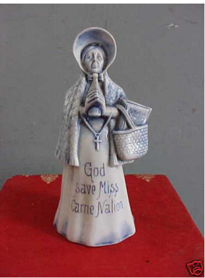
3. Woman whiskey nip