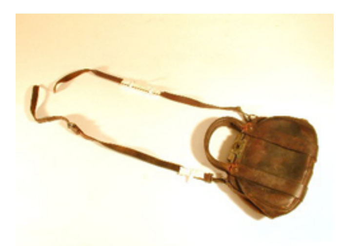
9. C. Nation's purse