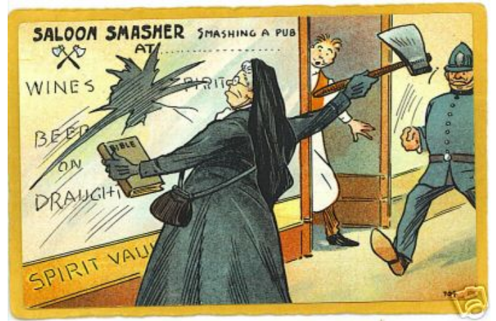
4. Postcard - Saloon Smasher #1

Thus began her rampage of vandalism against saloons all across Kansas and into neighboring states. Carry soon graduated from rocks to a hatchet, as shown in a postcard of the times ( Fig. 4 ). Her antics got her arrested more than 30 times and jailed on 22 occasions from 1900 to 1910, but they also secured her a national reputation among fervent Drys. Billed variously as the Bar Room Smasher, the Wrecker of Saloons, and the Home Defender, she drew large and enthusiastic audiences, mostly of women, with her widely advertised lectures ( Fig. 5 ). She titillated the crowds by shouting: " Oh, I tell you, ladies, you never know what joy it gives you to start out to smash a rumshop. " To the men she boasted: " You have put me in here a cub, but I will come out roaring like a lion, and I will make all hell howl !"