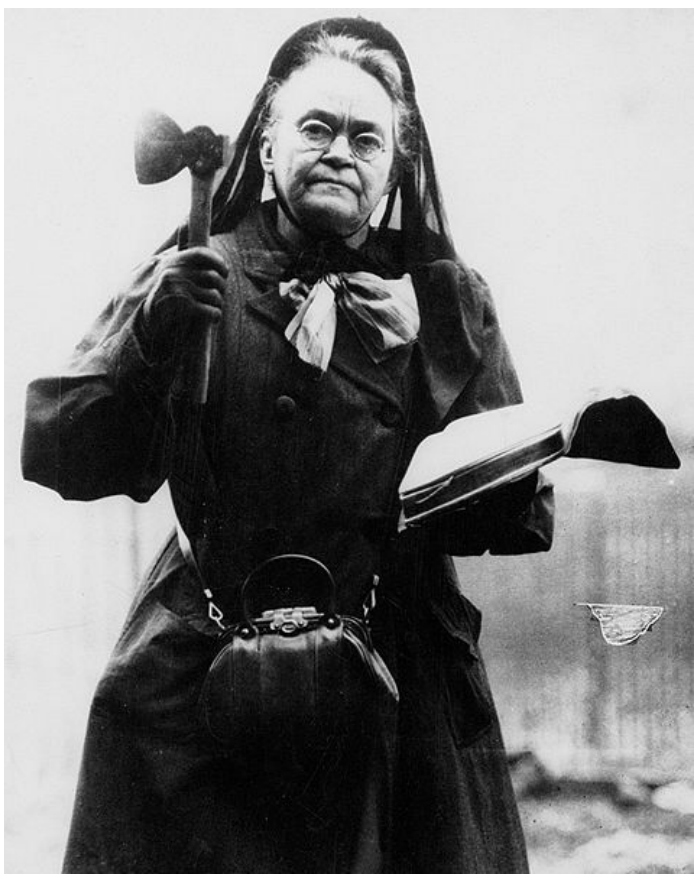
1. Carry Nation with hatchet and Bible

In February of 1904, the "chaste, yet bold" heroine of the poem above, a woman who stood six feet tall and weighed in at 175 pounds, came to the Nation's Capital, preceded by her reputation for creating havoc and destruction. Her name was Carry Amelia Nation ( Fig. 1 ), whose crusade of destruction against strong drink was enforced with an hatchet and whose legacy is found in bottles ( Fig. 2, 3 ) and other period artifacts .