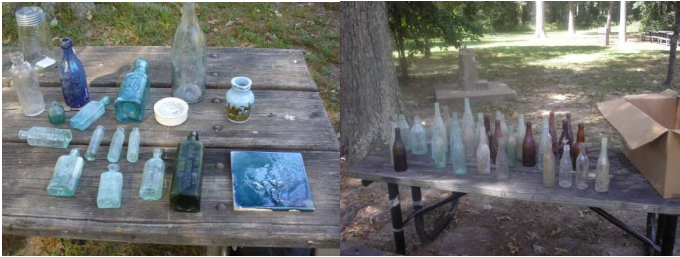
The bottles shown above were displayed at our club picnic in September. See page 3 for more picnic photos.