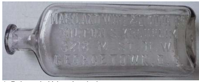
4. Embossed whiskey pint - both names