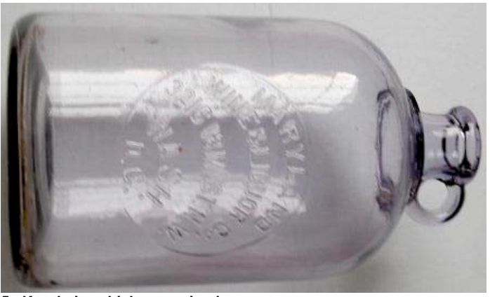
5. Kronheim whiskey or wine jug