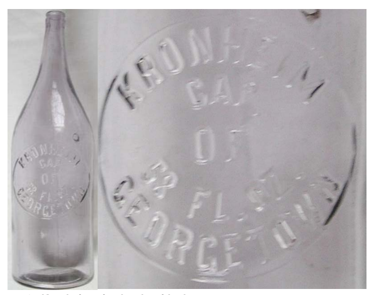
8. Kronheim wine bottle with close-up

Like other Washington, D.C. whiskey dealers, Kronheim merchandised through an array of giveaway items. Among them were shot glasses, one of them featuring the pig motif ( Fig. 9 ), and drink glasses. One of the latter advertises the firm as a "Mail Order House" ( Fig. 10 ), which probably dates it from around 1905 when neighboring states were going dry but liquor by mail was still legal.