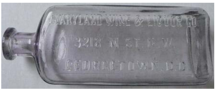
3. Embossed whiskey pint - Maryland Wine & Liquor Co.