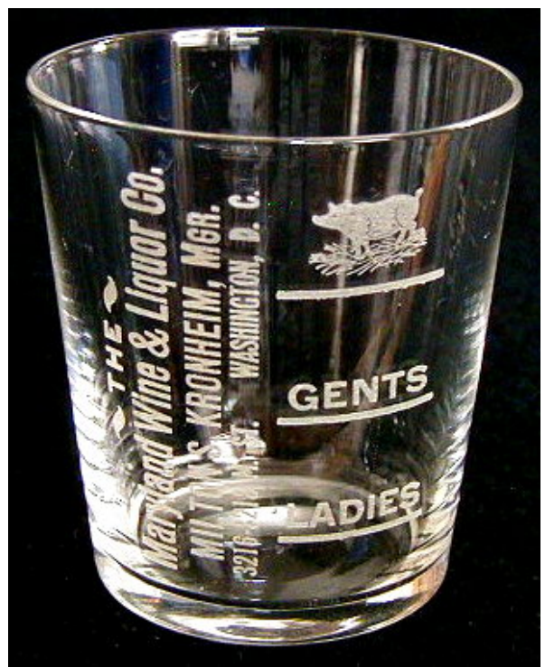
9. Kronheim shot glass

Like other Washington, D.C. whiskey dealers, Kronheim merchandised through an array of giveaway items. Among them were shot glasses, one of them featuring the pig motif ( Fig. 9 ), and drink glasses. One of the latter advertises the firm as a "Mail Order House" ( Fig. 10 ), which probably dates it from around 1905 when neighboring states were going dry but liquor by mail was still legal.