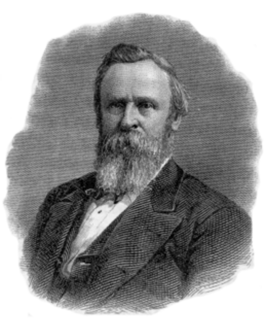
Figure 10: Portrait of Rutherford B. Hayes

Crawford's Shoe Store) to great crowd applause (Fig. 11). "Nothing of the sort could have been better than the demonstration on Fifteenth Street -Treasury on one side, Riggs House on the other.... It was enough to stir the blood of the coldest and the oldest," Hayes recorded in his daily journal.