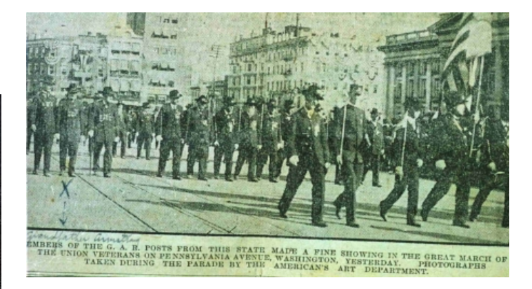
Figure 11: G.A.R. marching on Penna. Ave. in 1892

We began with a shoe manufacturer and end with the reminiscences of an ex-President. In between we have viewed antique paperweights, vintage magazine ads, Victorian shoe styles, an old post card, a plaster advertising statue, and G.A.R. souvenir medals – each of them a piece of memorabilia tossed up through the mechanism of an Internet auction.