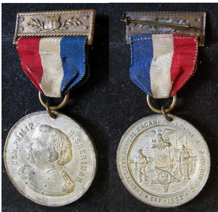
Figure 9: Encampment Medal #2 - front and back

Among the dignitaries attending the encampment was Rutherford B. Hayes ( Fig. 10 ), a former president of the United States (1877-1881) and himself a Union army officer during the Civil War. From Hayes we have one of the most complete narratives of what happen in Washington during the G.A.R. national event. The former President marched shoulder to shoulder with the rank and file as the "great parade" of veterans surged down Pennsylvania Avenue (no doubt passing by