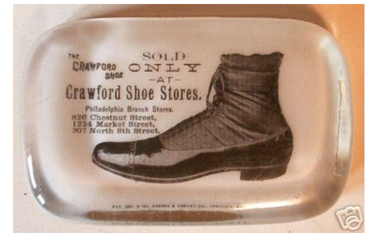
Figure 3: Paperweight featuring a shoe