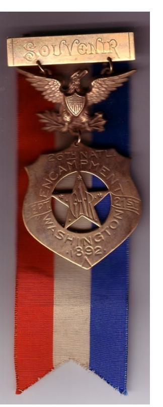
Figure 8: Encampment Medal #1

Back to the G.A.R. Encampment of 1892: A thriving veterans' organization of former Northern soldiers and sailors, the organization was a highly potent political force during the post-Çivil War era. Its national conventions featured commemorative medals sold to participants. Examples from the 1892 Washington Encampment recently have shown up on eBay. One marked "Souvenir" depicts an eagle and a star (Fig. 8). A second shows a bust of General Philip Sheridan on the front and an elaborate patriotic frieze on the back (Figs. 9).