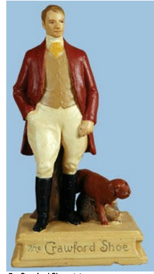
Figure 7: Crawford Shoe statue