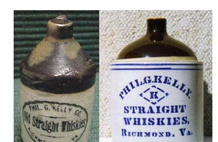
Fig. 7: Kelly Rough Jug