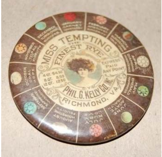
Fig. 2: Miss Tempting Pocket Mirror

The company first appears in Richmond directories around 1905, located at the corner of 17th Street and Franklin Streets, A 1909 ad gives its next address as "1413 East Main St." and shows a three story building with the slogan "The House that Treats You Right." ( Fig. 3 ). The same ad claims the Kelly enterprise as "importers, distillers and distributors of fine liquors." It is doubtful that the firm actually was a distiller. More likely it was a "rectifier," that is, a company that bought raw liquor from distillers, mixed and bottled it, slapped on a label, and sold it to the public.