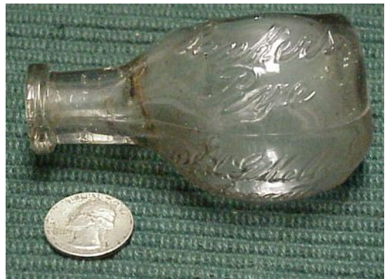
Fig. 1: Banker's Rye Miniature

For example, a fairly ordinary looking miniature pinch bottle of Kelly's Bankers Rye ( Fig. 1 ) sold on Ebay in October 2006 for $357. More recently, a Kelly advertising hand mirror, two inches in diameter, with pictures of birthstones on the back brought $103.50 ( Fig. 2 ). A Kelly giveaway thimble, probably costing a few cents to make, sold for more than $20. The firm's bottles and jugs regularly sell for hundreds of dollars. The only explanation for such advanced prices is competition among Virginia collectors for Kelly products.