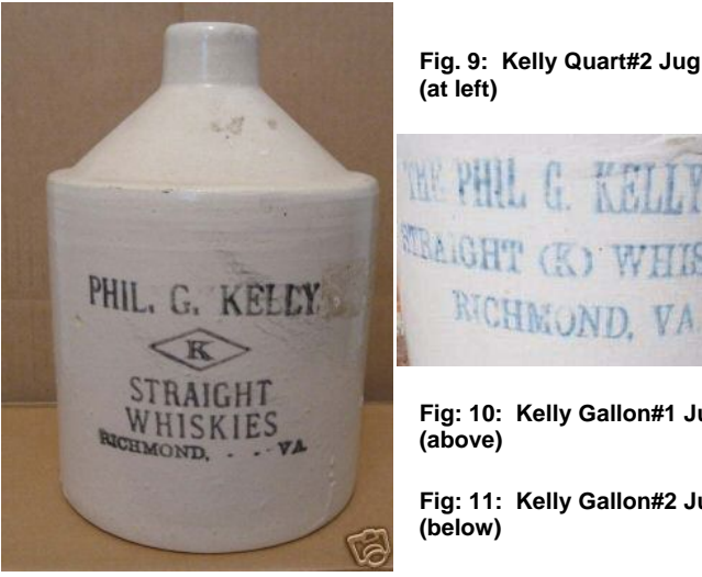
Fig. 8: Kelly Blue Stencil

RICHMOND, VA Fig: 10: Kelly Gallon#1 Jug