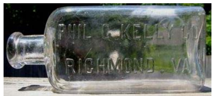
Fig. 4: Kelly Pint Bottle

Part of the Kelly mystique may be the prominence of its name on its whiskey containers. The firm embossed many of its glass bottles prominently with its name and often added decoration (Fig. 4,5). My own preference has been for Kelly jugs and an early addition to my collection was a quart ceramic with a flat shoulder and strong black lettering. (Fig. 6). That is only one among perhaps a dozen variations of Kelly jugs. They range from very crude (Fig. 7) to very sleek (Fig. 8), with a number of variations in between (Figs. 9-11).