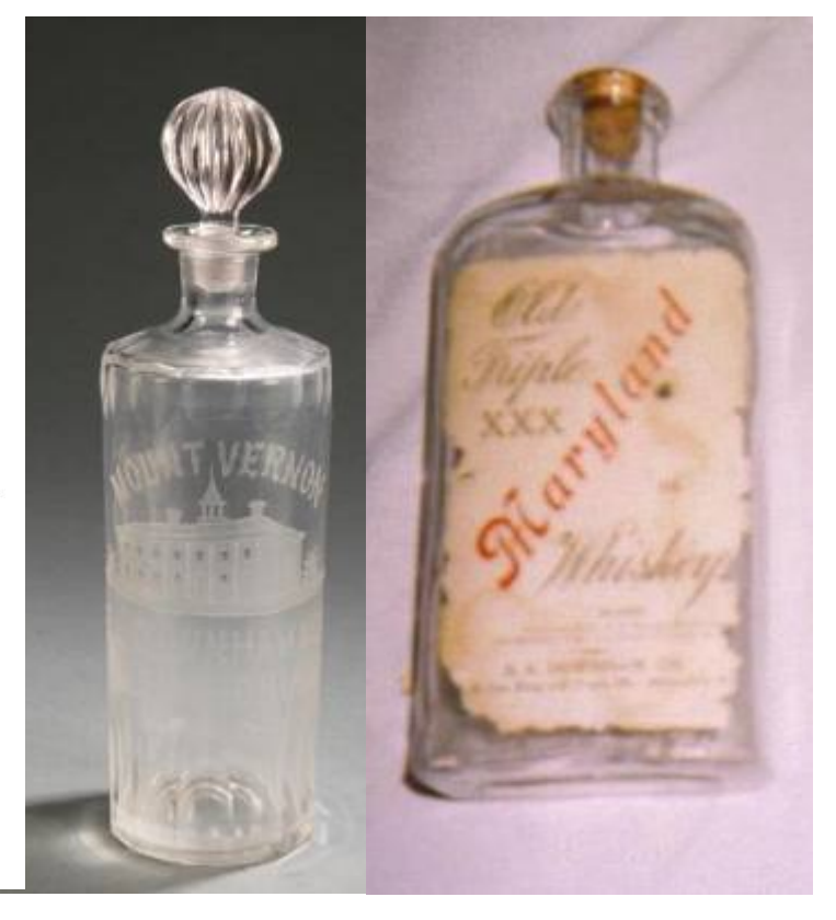
Fig. 4: Belle Haven "Mount Vernon" Decanter (at left)

"Old Mansion," which used an illustration of Mount Vernon on the label and on back-of-the-bar decanters ( Fig. 4 ). Others were "Old Dominion Family Rye," "Crystal Maize-Straight," "Old King Corn," "Mountain Corn" and "Old Triple XXX Maryland Whiskey" ( Fig. 5 ). The flagship brand was "Belle Haven Rye," with a well-designed label featuring heads of grain. ( Fig. 6 ).