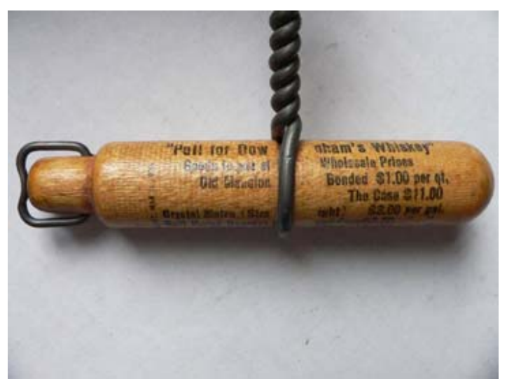
Fig. 7: Downham Corkscrew