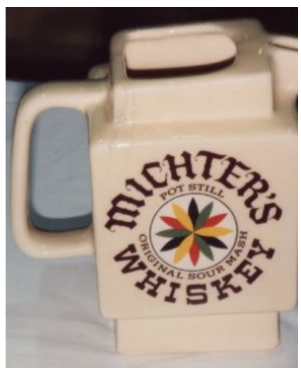
Figure 4: Hex sign pitcher

My particular favorites are a set of blue stoneware jugs with a dove of peace on each and the inscription "1753." They come in four sizes, including (shown here) a mini and a 4/5ths (Fig. 5). All have an interesting stopper designed to hold a candle. The jugs were made for Michter in the early 1980s by the Hall China Company of East Liverpool, Ohio.