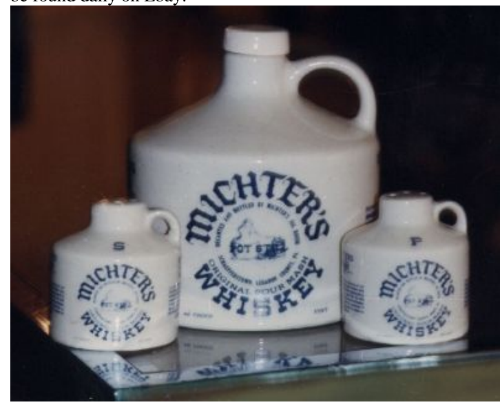
Figure 1: Whiskey jug and jug salt & pepper (above)

In addition to selling its whiskey to tourists, Michter's also put out a line of interesting jugs, water pitchers, and other collectible items (Figs. 1-4). At a time when Beam bottles were a craze, the company followed suit with its own line of fanciful figural ceramics. They included a football player, Chinese pagoda, covered wagon, and Noah's ark. Michter collectables can be found daily on Ebay.