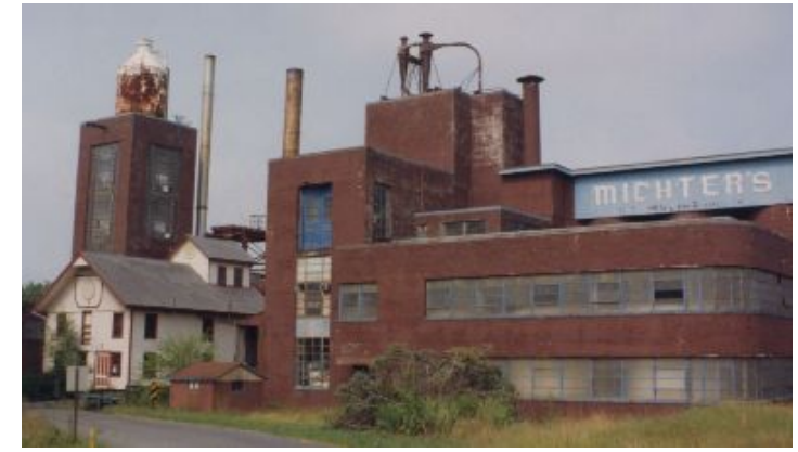
Figure 6: The abandoned distillery

But neither a small coterie of whiskey fanciers nor Michter's line of ceramic goods could keep the bankruptcy lawyers at bay. In 1988, the distillery shut its doors for good. When I visited Schaefferstown in 1993, the neglect was already evident. The trademark jug on top of one of the distillery building was already rusting away, as was a forlorn sign welcoming non-existent tourists (Figs. 6,7). The distillery had been removed from the rolls of National Historical Landmarks. Michter's obituary was all but written.