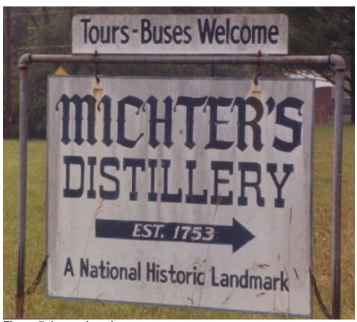
Figure 7: Its rusting sign

But the distillery had a hidden asset: barrels of prime whiskey aging away in its Federally-sealed warehouses. As various interests vied to tap into them while trying to avoid old company debts, time slipped away. Late in the 1990s the Michter brand and whiskey supplies finally came under the ownership of Chatham Imports, a New York firm that is a major importer of alcoholic beverages. After several years of preparation, the brand reappeared while the distillery was left to molder. Michter fans, recognizing that the warehouse supplies were limited, began to worry.