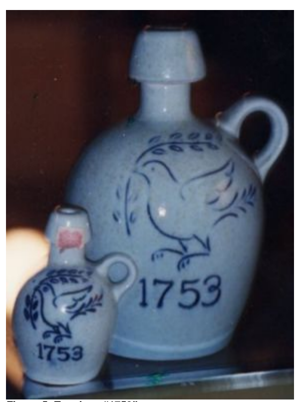
Figure 5: Two jugs "1753"

My particular favorites are a set of blue stoneware jugs with a dove of peace on each and the inscription "1753." They come in four sizes, including (shown here) a mini and a 4/5ths (Fig. 5). All have an interesting stopper designed to hold a candle. The jugs were made for Michter in the early 1980s by the Hall China Company of East Liverpool, Ohio.