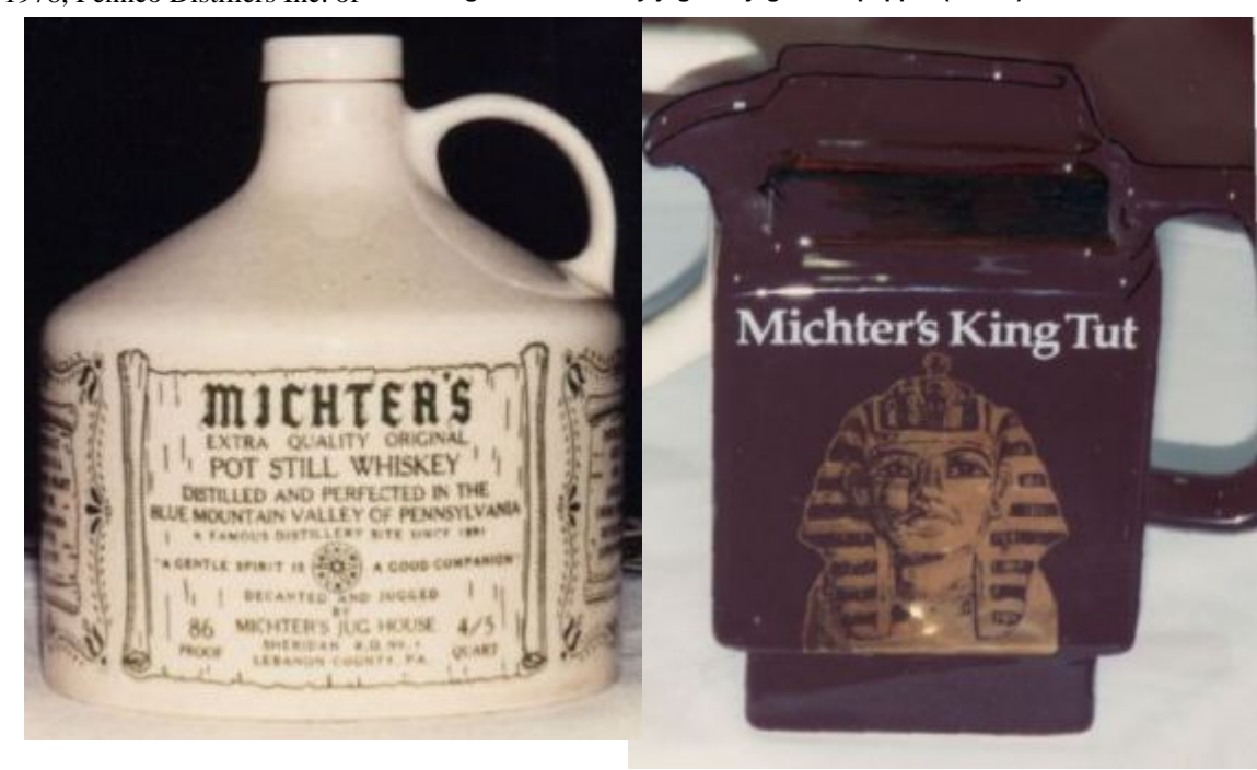
Figure 2: Single "Pot Still" jug (left) Figure 3: King Tut pitcher (right)

In 1980 Michter's was named a National Historical Landmark by the U.S. Department of the Interior as the oldest