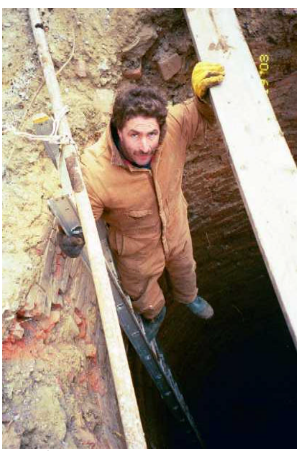
Sheldon at the top of a 20 foot ladder

The weather forecast called for clear skies with a chance of flurries and temperatures in the high teens.