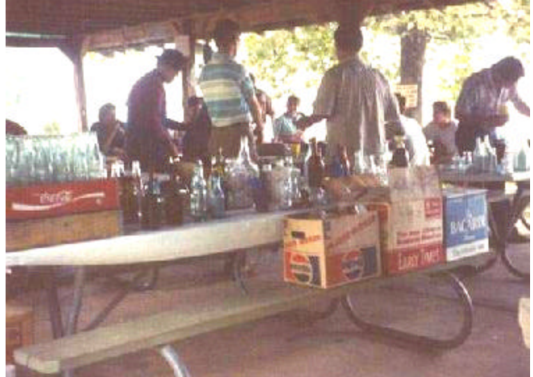
Picnic time is September 14 th . See page 2 for details.

Our next meeting will be on the usual date: the last Tuesday of the September. Lee Shipman is interested in hearing if people would prefer moving future meetings to Friday evenings. Please give Lee your opinions at (301) 229-2005 or plannerlee@earthlink.net .