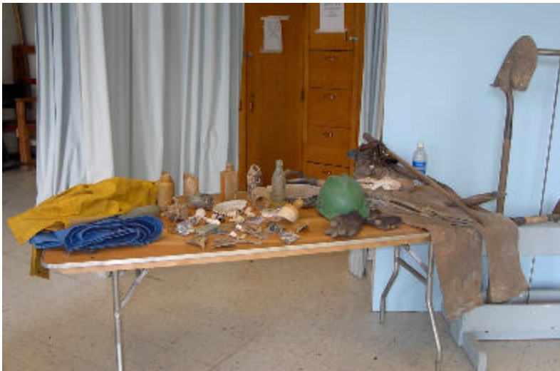
Top Left: Ken Anderson put on an impressive display of bottles and advertising for Bliss Native Herbs.