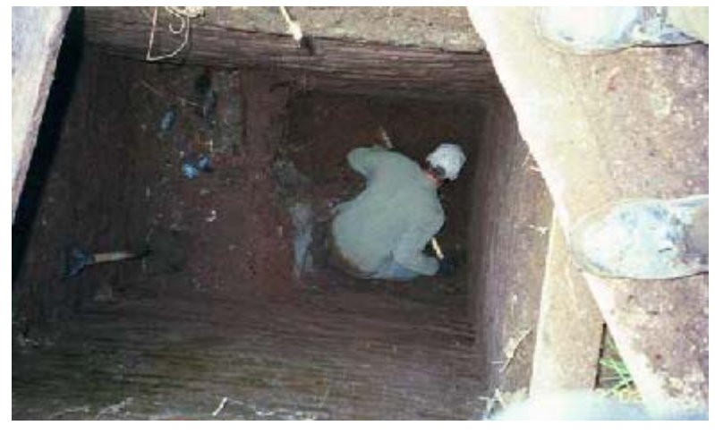
Strange Days Indeed: 12 Feet into a Square Brickliner in Mississippi and Finding Nothing but New York and New Jersy Bottles