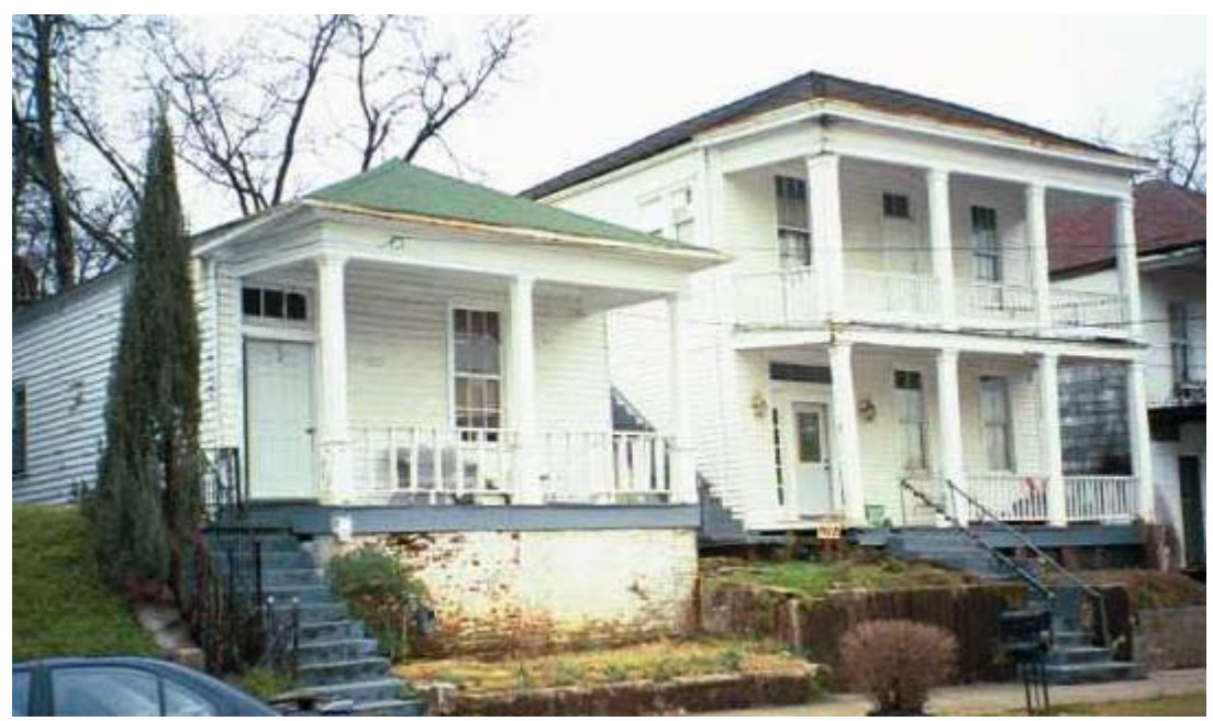
Over a Dozen Privies were Dug Behind these Beautiful Vicksburg, Mississippi Homes