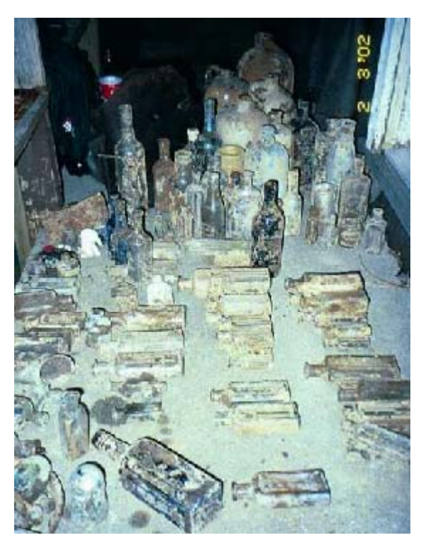
Loads of Vicsburg, Natches & New Orleans Druggists, Jugs, Biedenharns, and Tonics